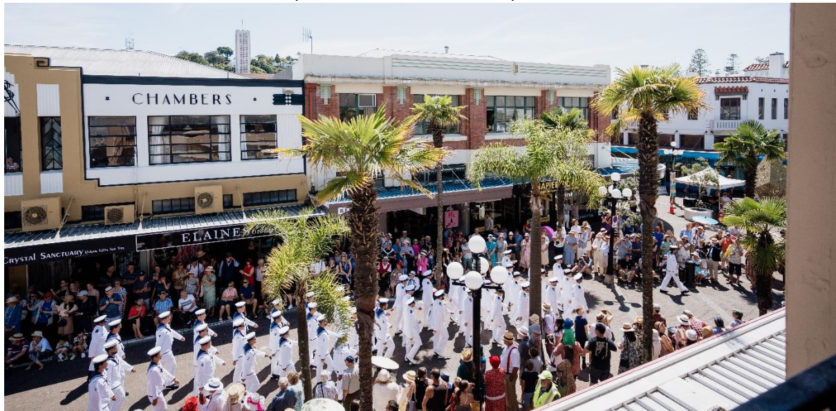
Vintage Car parade as part of the 2024 Art Deco Festival Napier

The summer Art Deco Festival Napier 2024 went ahead as planned!